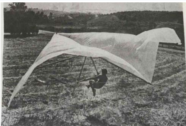
CD Photo — Craig Copeland